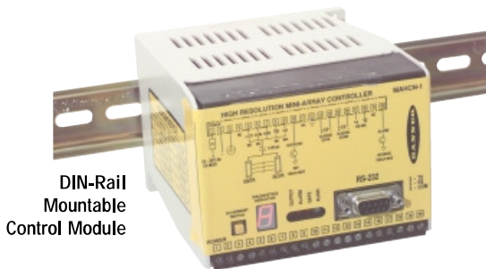
DIN-Rail Mountable Control Module

Configure and monitor the System with the supplied software and any PC-compatible computer (running Windows® 3.1, 95, 98 or NT), via an RS-232 cable.