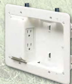
TVL508 5" x 8" TV Box™