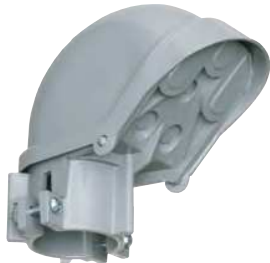
PVC105, PVC106, & PVC129