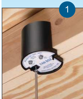
1. Position box alongside joist. Tighten center screw, mounting box to joist.