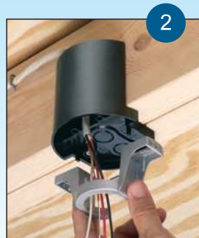
2. Position mounting bracket over locator posts to assure proper position. Pull wires through KO.