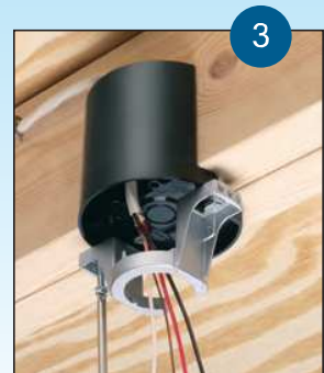
3. Remove captive bracket installation screws. Use them to mount fan/fixture bracket. (Installation of drywall not shown.)

Note: Install fan or fixture (not included) in accordance with manufacturer's instructions and all local applicable electrical codes, using the parked screws provided.