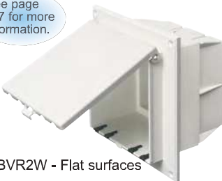
DBVR2W - Flat surfaces