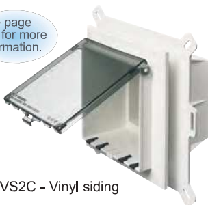
DBVS2C - Vinyl siding