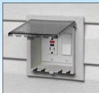
Completed installation, DBVS2C shown.

Box with weatherproof-in-use cover; installed bug plugs; (1) decorator wall plate; and (2) NM cable connectors. DBVM2 also includes a block bushing with washer; and an in-place, disposable mud cover. DBVR2 also includes (1) set installation screws; and (1) roll of caulk. DBVS2 also includes (1) set installation screws.