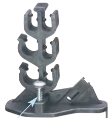
#8 self-tapping sheet metal screw CS20SC