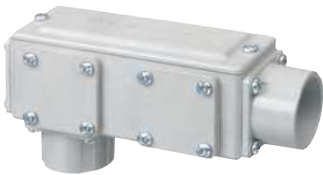
935NM ships as LB

Non-metallic. Five conduit bodies in one! Ships as an LB, but converts to a T, LL, LR, or C. Switch covers and flanges as needed to create the style you need. Includes cover, foam gaskets, and screws.