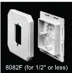
8082F (for 1/2" or less)