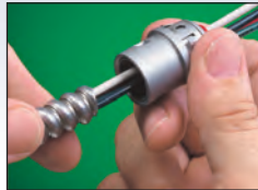
Snap onto cable and give a clockwise twist.