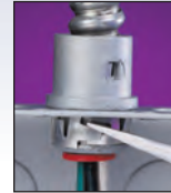
Using a screwdriver, lift the ring and twist off.