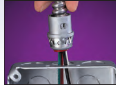
Just snap into box!