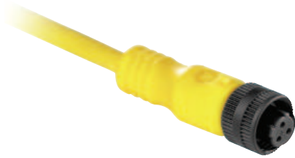
3-Pin AC Micro Cordset