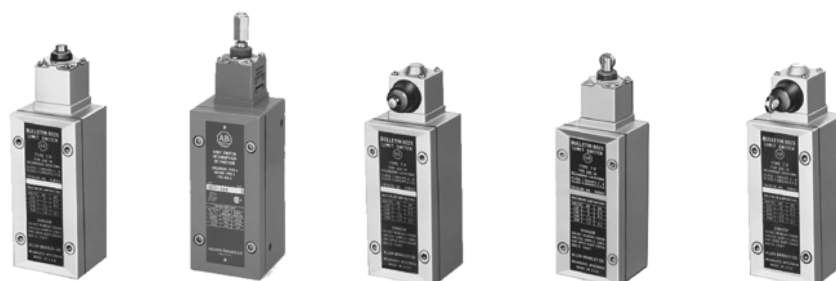
Top Push Rod Adjustable Top Push Rod Side Push Rod Top Push Roller Side Push Roller