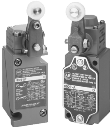
Plug-in Style 802T-AP with Lever