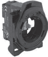
Plastic Latch with Contact Block