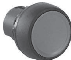
Bul. 800FP Plastic Operators