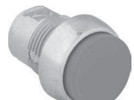
Bul. 800FM Die-Cast Metal Operators