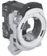
Metal Latch with Contact Block