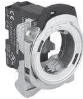
Metal Latch with Contact Block