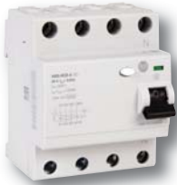
1492-RCD Residual Current Devices