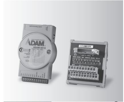
ADAM-6018 FCC CE RoHS UL LISTED E192881 E.T.C.