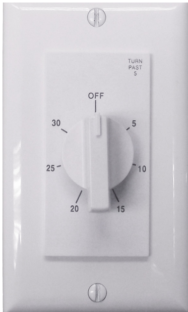
# 93502 - 30 Minute Timer Shown