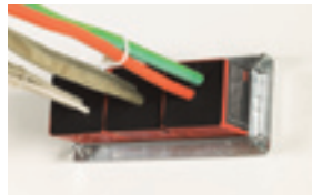
Three (3) devices shown with triple mounting bracket

3M Fire Barrier Pass-Through Devices meet the ASTM E 814 UL1479 Fire Test Standard and are fire-rated for up to 3 hours (dependent upon system application). 3M Fire Barrier Pass-Through Devices use a fixed intumescent material (expands with heat) which works in conjunction with a foam plug and optional mounting or stud brackets. In the event of a fire, intumescent material expands to seal the inside of the device, helping to prevent the spread of smoke and fire into other compartments.