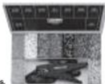
Part number 651-1202072 illus.

Features: 651-3202960, 651-3202973, 651-3202999